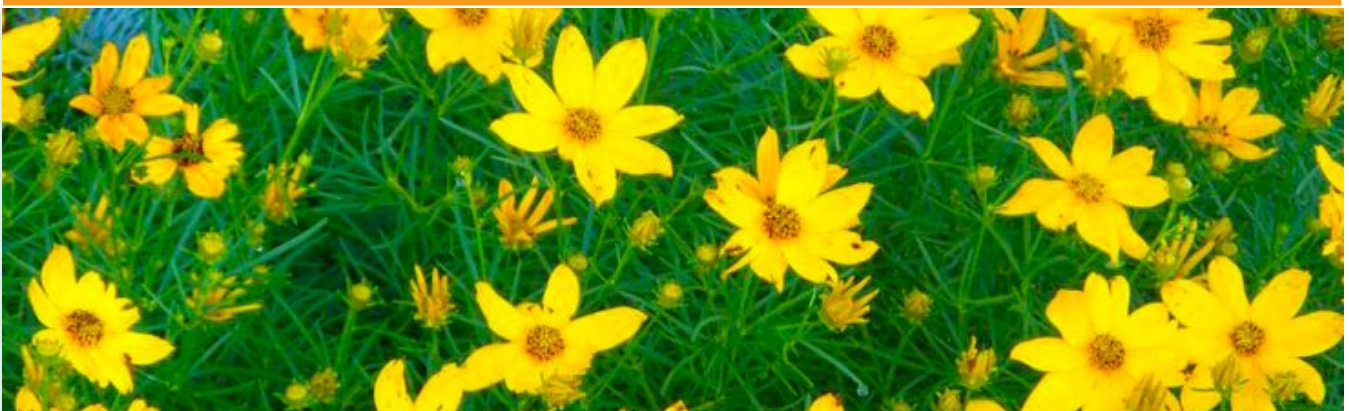
Above: Coreopsis. Blooms throughout summer. Prefers full sun. Deadhead to encourage more blooms